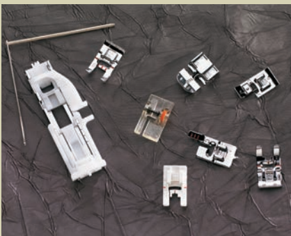
Presser feet EMERALD™ 118 and 116: Utility foot A, Decorative foot B, Buttonhole foot, Adjustable Blind Hem foot, Zipper foot E, Non Stick Glide foot H, Edging foot J, Edge/Quilting Guide, Automatic Buttonhole foot.