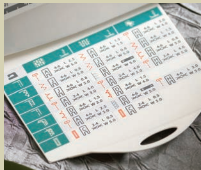
Need advice? Reach for your Sewing Guide Reference Chart! Your EMERALD™ features a simplified Sewing Guide Reference Chart that helps with the right settings. Pull it out from the base of the machine.

EMERALD™ 118 creates 70 stitch functions.